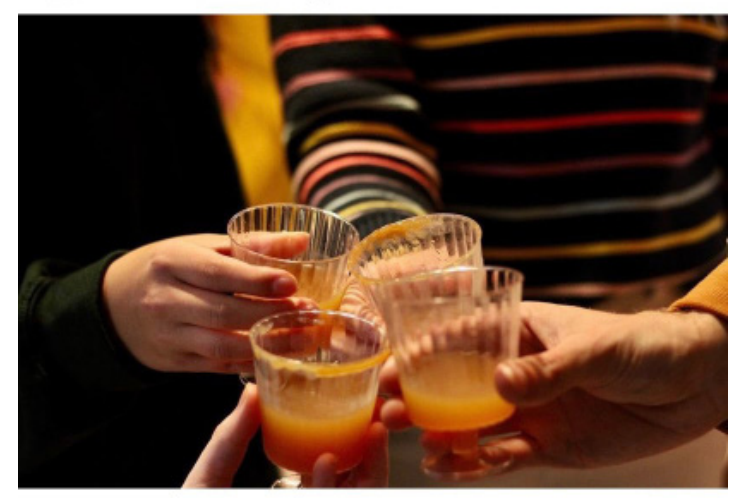
Pictures above taken at our Halloween Party Social